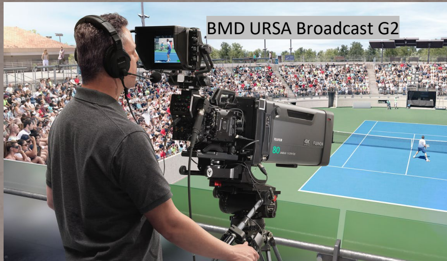
BMD URSA Broadcast G2