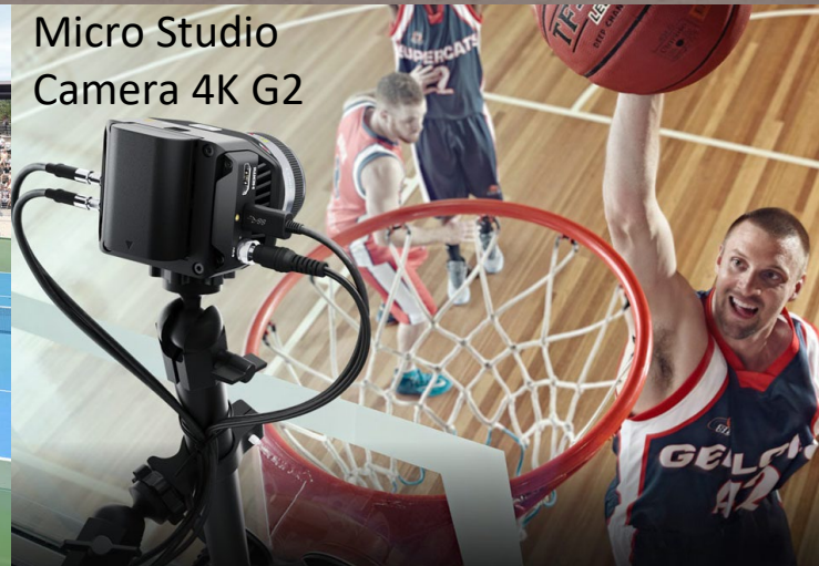
Micro Studio Camera 4K G2